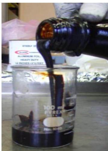
Figure 1: Coal tar (1).

Coal tar (figure 1) is a brown or black liquid of high viscosity, which smells of naphthalene and aromatic hydrocarbons. Coal tars are complex and variable mixtures of phenols, polycyclic aromatic hydrocarbons (PAHs), and heterocyclic compounds.