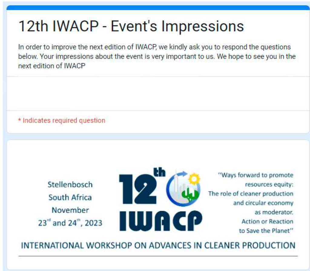
Figure 6. Partial view of evaluation form sent to participants of the 12 th IWACP.

According to the evaluation, 43% of the respondents believed their event's goals were fully reached. The other 43% of the respondents felt that the event achieved more than 85% of their goals. The 12 th IWACP met audience expectations in all responses.